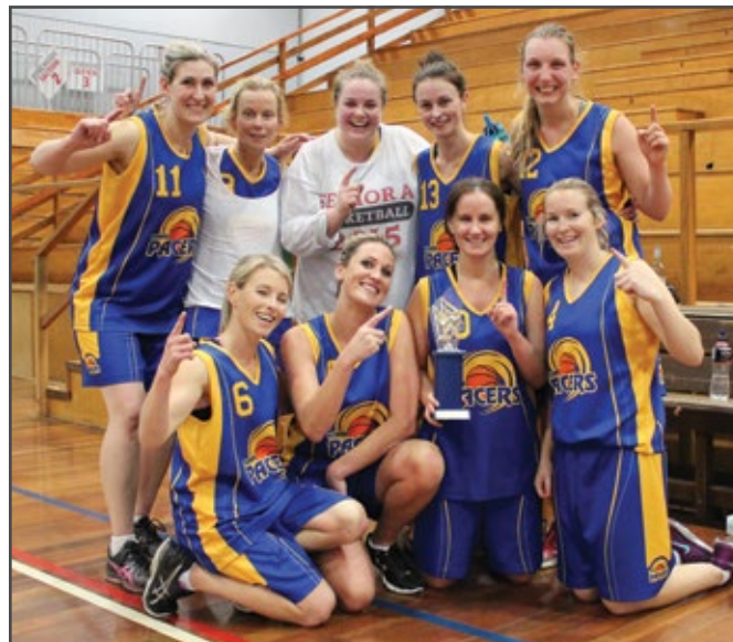
The Pioneer Saints – Women's Midweek Champions 2016