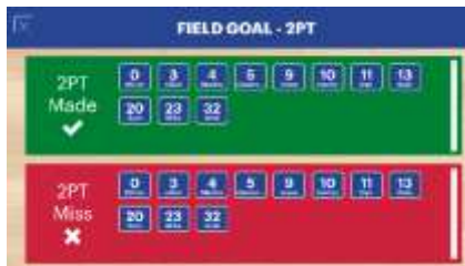
The shot attempt screen

3. Shot Attempts: Tap the game screen at the position of all shot attempts, as soon as possible ( except when there is a foul on the shot ). Select either shot made (green) or shot missed (red) and the number of the player. The position of the screen tap will determine if a 2 or 3 pointer (note: the tap position must be in the correct half of the court that the team is scoring. If a shot is successful from over half way you must still tap in the front court).