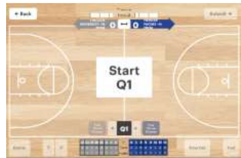
The Game Screen