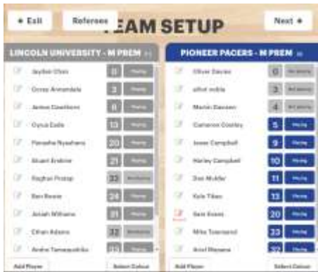
The setup screen

1. Before the Game Starts: Registering players/changing numbers/assigning colours. These are all accessed in the TEAM SETUP screen. Tap the Team set up button and follow instructions.