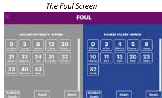
The Foul Screen